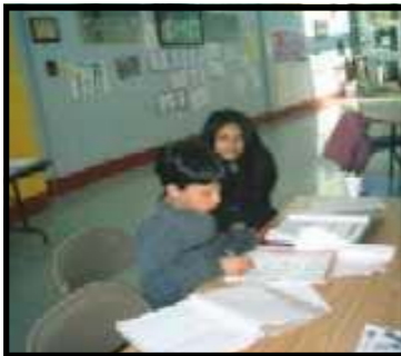
Student in after school program being tutored.

IN REACH, INC. 4103 Oliver Street Hyattsville, Maryland 20782 Tel: (301) 779-2564 Fax: (301) 779-0422 Inreachinc@aol.com