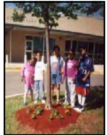
First gardening project completed.