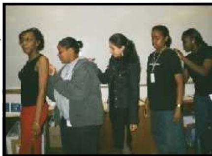
Students participate in a warm-up activity.

During the 2001-2002 academic year, an article was written about the program and featured in The Gazette Newspaper, where one student was quoted as saying that she participated in the program for the “structure and support the program offers.”