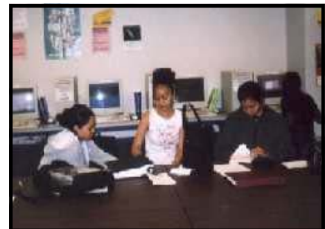
Include Me students reviewing materials.