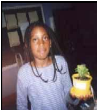
Student holding self-potted plant for Teacher Appreciation Day.