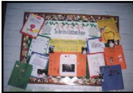
Display of handmade teacher appreciation cards.